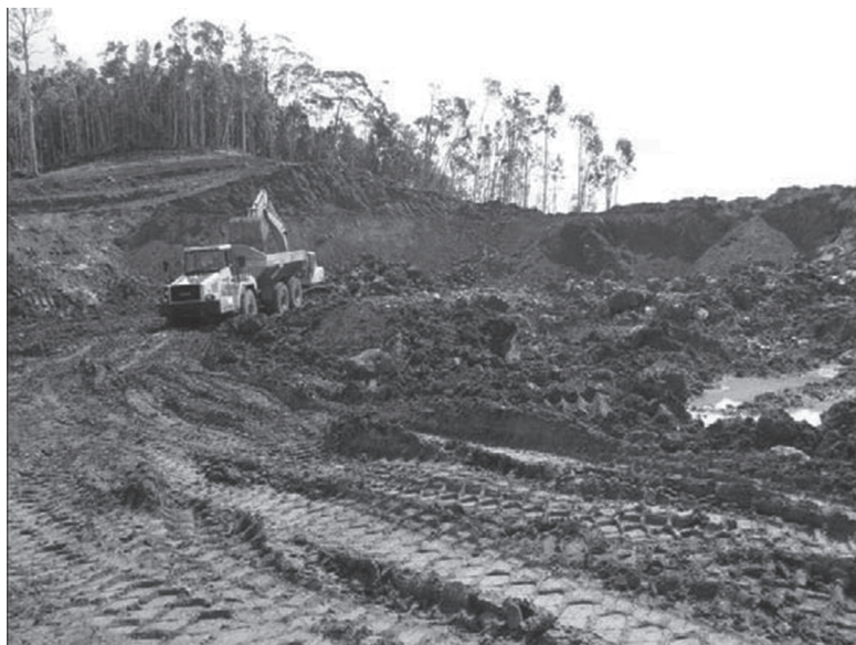
Indonesian Nickel Ore Mine

This is certainly not a new phenomenon – over the past 5 years, several organisations have published excellent bulletins on the subject (referenced under further reading).